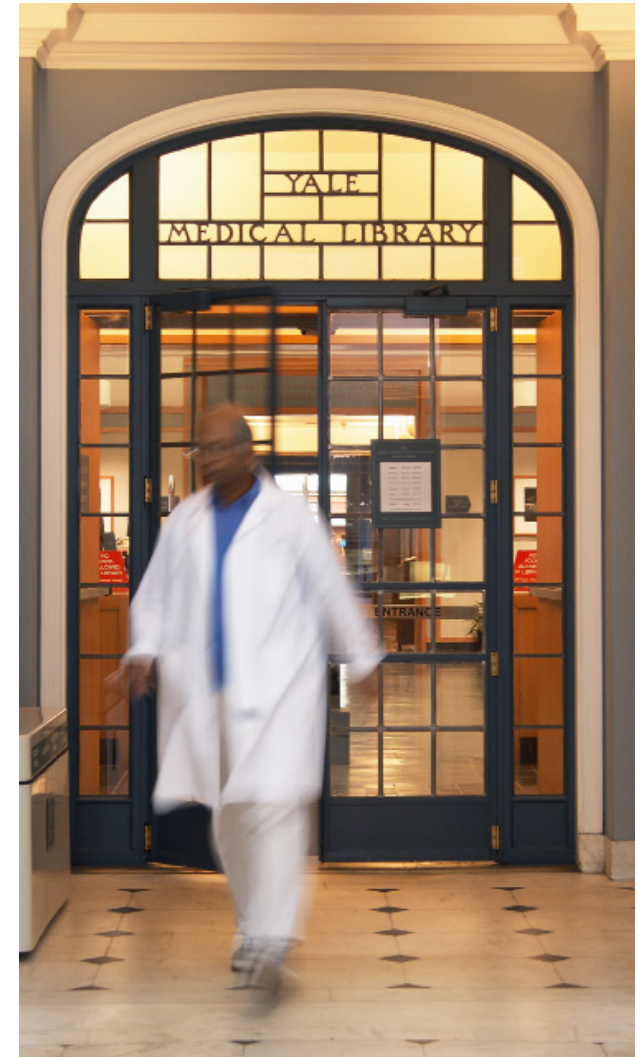
Yale Harvey Cushing/John Hay Whitney Medical Library